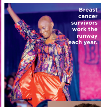
Breast cancer survivors work the runway each year.